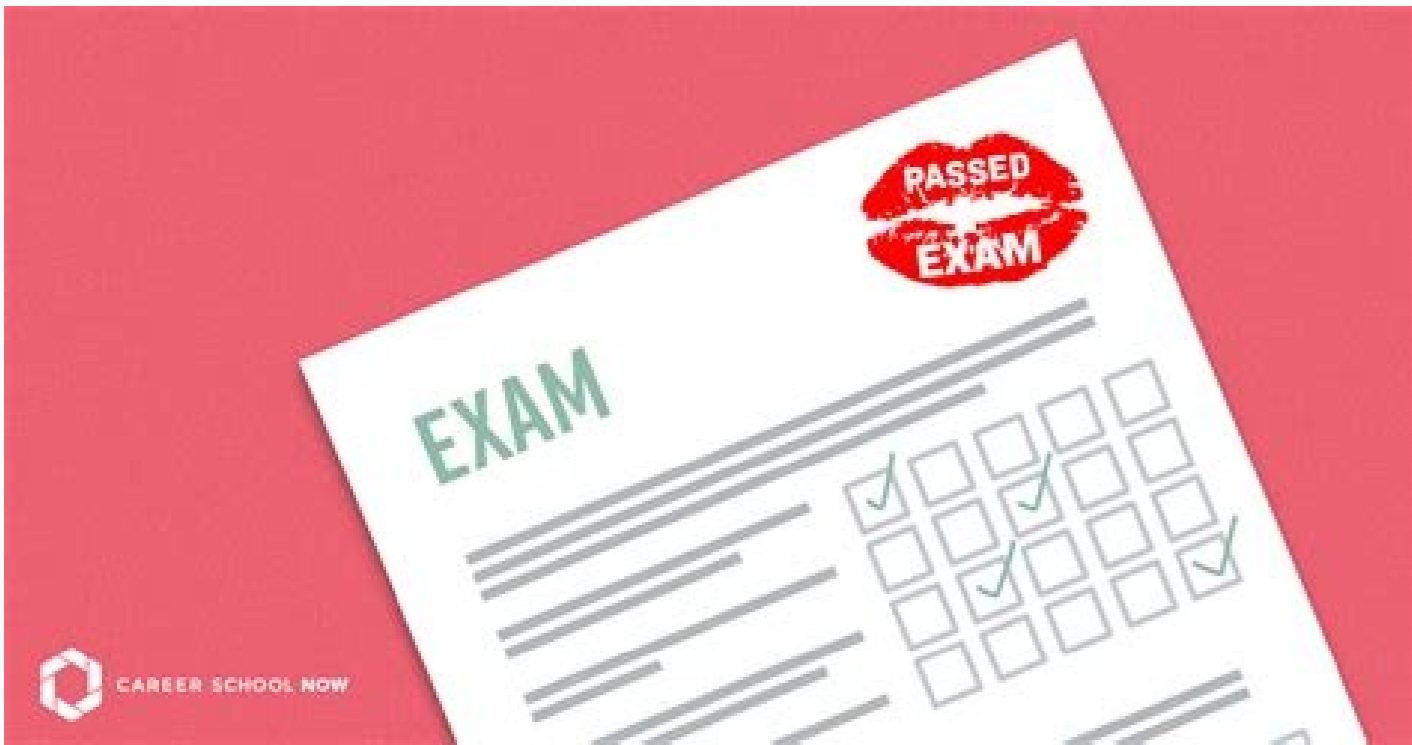
Illinois cosmetology license exam study guide. Study guide for illinois cosmetology state board exam.